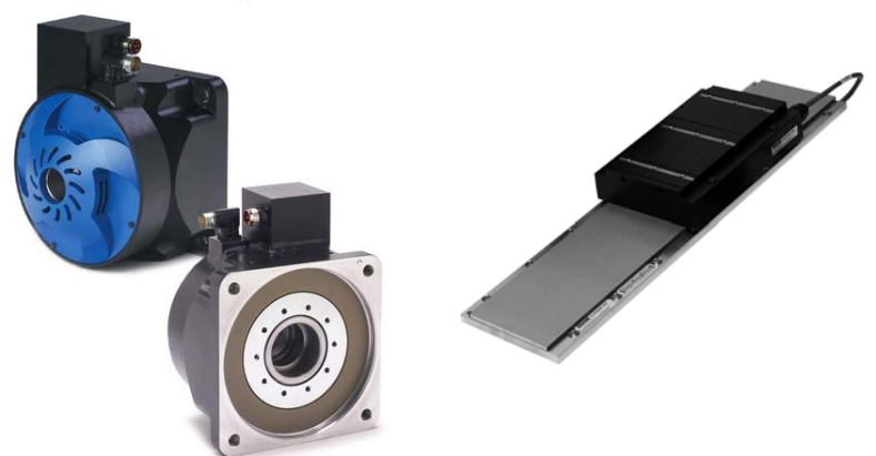
Figure 2 – Kollmorgen's <u>DDL</u> and <u>DDR</u> direct drive motors eliminate the need for a transmission.

While dual-loop solves many problems caused by load inaccuracy, the ultimate solution is a "direct drive" system, which eliminates the transmission altogether. In direct drive systems, the motor (see Fig 2) directly drives the load. The accuracy of direct drive systems is 10x better than traditional systems; audible noise can fall by 40 dB. Other measures such as servo response, acceleration rates, and reliability also can improve dramatically. For the most demanding servo applications, direct drive is the final step of evolution for the mechanical design.