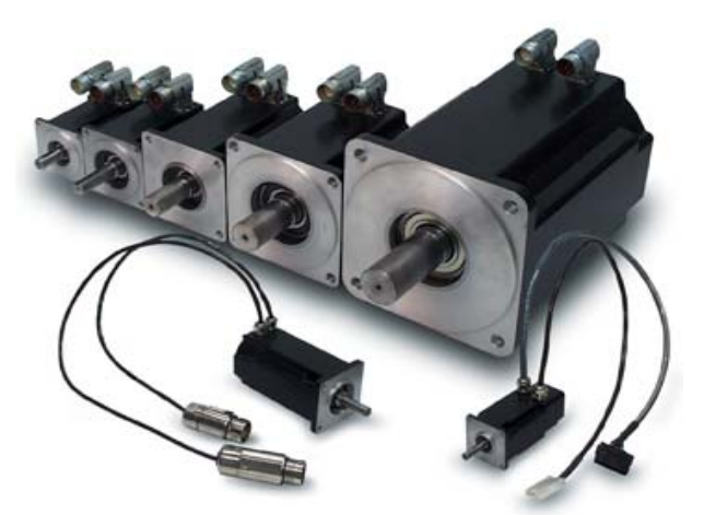
Figure 1 - Kollmorgen's AKM servomotor family supports a wide range of feedback devices.

The second type of accuracy is more complicated: cyclical error. When a motor turns at constant speed, position errors translate into an apparent velocity ripple. This ripple repeats every revolution of the motor, hence the name, "cyclical." The apparent velocity ripple on the feedback signal feeds the velocity loop, which creates current to compensate for that ripple. Unfortunately, that current creates actual velocity ripple. The result is often a loss of smoothness at speed and an increase in audible noise and motor heat. Cyclical error is cured by higher-accuracy feedback devices. Sine encoders have so little cyclical error that they often produce no measureable effects; the same cannot always be said of resolvers and digital encoders. The key to for machine designers is selecting the right feedback device for each axis of motion. The best starting point is a motor family with a wide range of feedback options such as Kollmorgen's <u>AKM™ servomotors</u> (Fig 1).