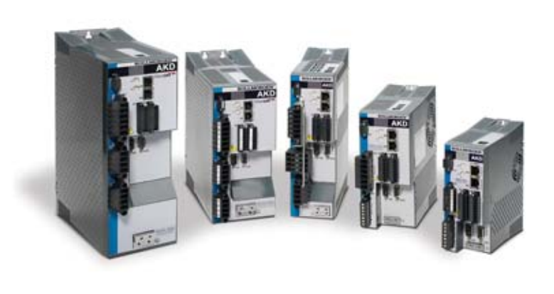
Figure 3 - Kollmorgen's AKD servo drives supports a wide range of options for improving servo performance.

When you want to improve system performance, you also need to consider the drive. Flexibility is a key characteristic. As discussed above, flexibility in support of feedback types and motor types will give you more options for accuracy issues. Other areas of flexibility are: a wide range of servo algorithms, support of multiple communication buses (EtherCAT® and CANOpen®, for example), and a large range of voltage and current models. By choosing a family of drives that can support the widest range of options, you'll be able to operate your servo system in the largest number of applications and you'll have the biggest toolbox possible when it comes time to deal with servo performance issues. For example, Kollmorgen's <u>AKD™ servo drive family</u> (Fig 3) supports a wide range of feedback devices, servo algorithms, communication buses, and power ranges.