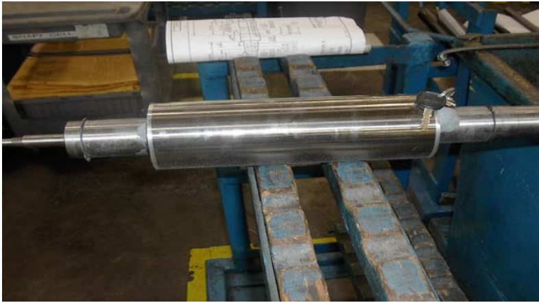
Kollmorgen B-808 PM Brushless Rotor