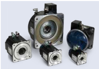
Kollmorgen Cartridge DDR® Motors combine the performance advantages of a frameless motor with the ease of installation of a full-frame motor. The largest motor shown is approximately 35 HP.

Permanent magnet servo and induction motors have long had performance areas that overlap but are not a replacement for one another. Advancements in drives and technology for the induction motors have given them dynamic performance that was once the mainstay of permanent magnet servo systems but this doesn't mean that the induction motor is a replacement for the servo; it just allows for more options.