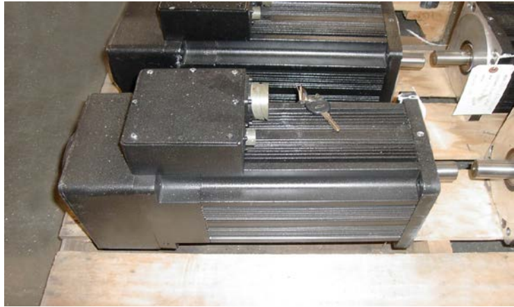
Kollmorgen B-802 PM Brushless Servomotor at 15 HP