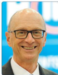
Author: Ian Young, Key Account Manager, Kollmorgen, Ratingen

Ultimately, the quiet operation and high-quality control of the synchronous servo motors ensure the robots can be used outside of handling applications, too. Up until now Universal Robots' focus has been to use the robots as a tool for performing simple tasks. "We are therefore not competing directly with other robot manufacturers who deal with more complex tasks. Instead we are saving people from having to perform tiring, monotonous manual work," stresses Østergaard. As the company from Odense has developed light constructions without uncontrollable oscillations and vibrations, however, there are new application possibilities; such as with welding and gluing. "We can expand our business channels," says Østergaard. This development is accompanied by the fact that due to sophisticated safety technology both models are even able to be employed without additional shielding. This opens the path to a safe and comfortable cooperation between staff and technology.