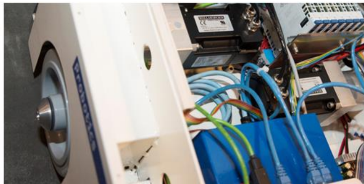
Optec uses synchronous servomotors from the KOLLMORGEN AKM range in a 48 volt version as drives for both wheels

The AKM-31’s regular nominal power rating is 1.3 kW with its 400 V winding. With the adjustment to 48 volts the compact units provide 300 watt of power with planetary gears installed directly. As supplier of fully-integrated automation systems, SigmaControl has used the S-Dias range from Sigmatek together with the KOLLMORGEN motors. “This way we have matched the perfect couple, implementing the control movements with different speeds on the wheels and also taking responsibility for the process and motion control”, says Frank ten Velde, Account Manager for SigmaControl, exclusive distributor of SIGMATEK Netherlands. The DC 061 axis module provides virtually 300W of nominal power and is designed to control a synchronous servo motor with up to 6A of continuous current at 48V DC. The breakaway torques required when starting up the mobile transport robots can be easily controlled since the module is able to provide a peak current of up to 15A at short notice. “This allows us to avoid constantly oversizing the drive technology, thereby saving space and helping us to extend coverage, since the batteries don’t need to supply as much electrical power”, explains Frank ten Velde further. Together with Dynamic Drives the company has already been working for more than 20 years as a certified partner in Belgium and the Netherlands to KOLLMORGEN.