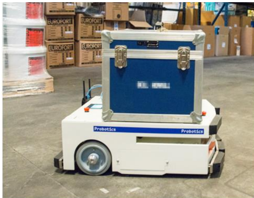
The AIVs weighing 40 kilograms can transport useful loads of up to 150 kilos

The mobile robot systems are connected via WiFi with a fleet management system which in turn communicates with a higher-level ERP system and receives the travel jobs from there so that the Packman 200 does not lose its bearings. The network is so finely interconnected based on the Industry 4.0 concept that the ANT (Autonomous Navigation Tool) always passes the job onto the correct Packman. The correct one depends for instance on the distance to the job destination, the capacity of the relevant battery, as well as on the relevant model is capable in the first place of transporting the freight weight required. "Our self-driving systems have a modular structure, because of which there will be different categories of weight", says Henk Kiela, Managing Director at Probotics. The current model is able to transport loads of up to 150 kilograms with an own operating weight of 40 kilos, and with availability of more than six hours. The mobile assistant then needs to return to the charging station.