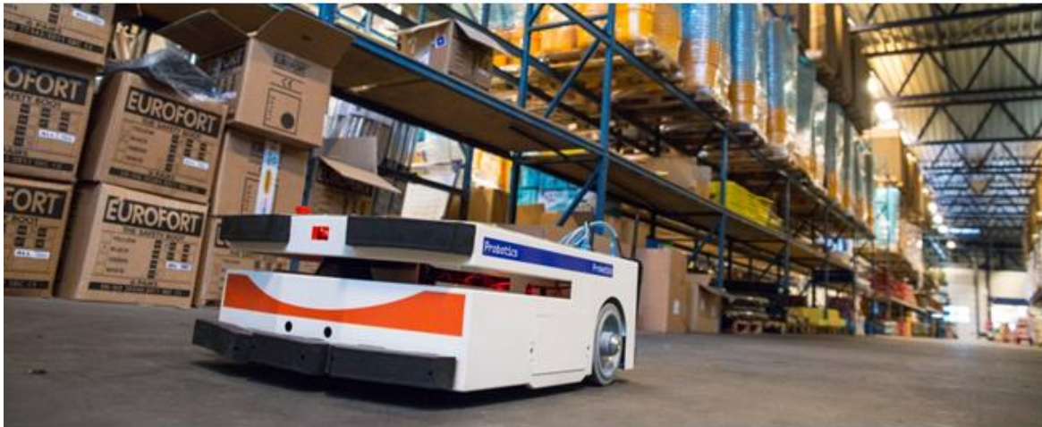
The Packman 200 finds its own way through the rows of shelves.

DC servomotors in KOLLMORGEN's AKM series with 48 volt winding for autonomous vehicles