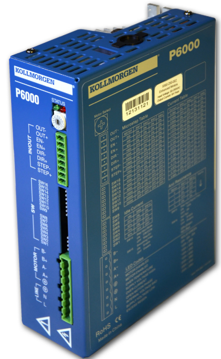
P6000 Stepper Drive