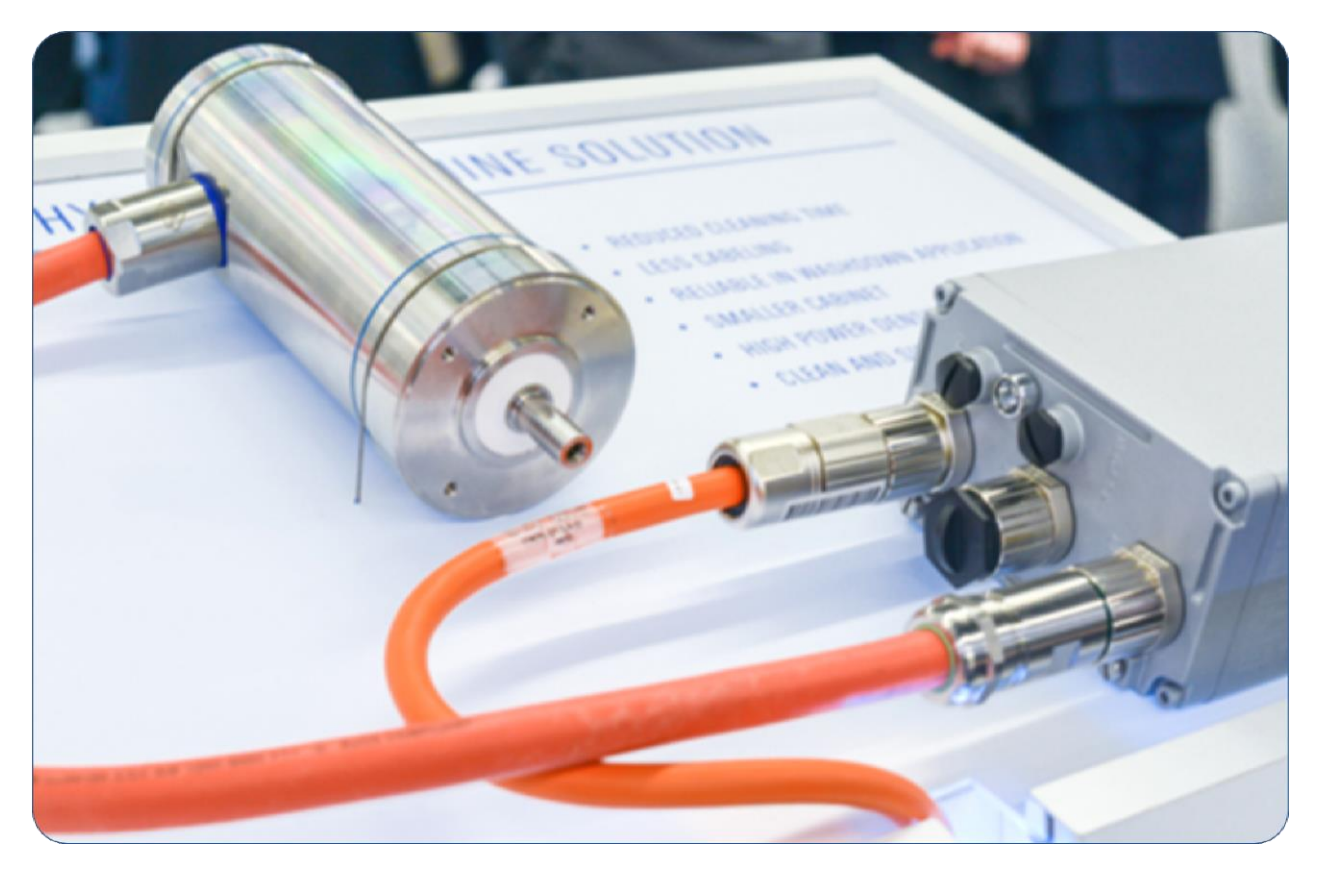
Thanks to the multi-language interface, decentralized servo axes with stainless-steel motors can be incorporated very easily into different control systems.

KOLLMORGEN develops a multi-language interface for Profinet, Ethernet/IP, EtherCAT & Co.