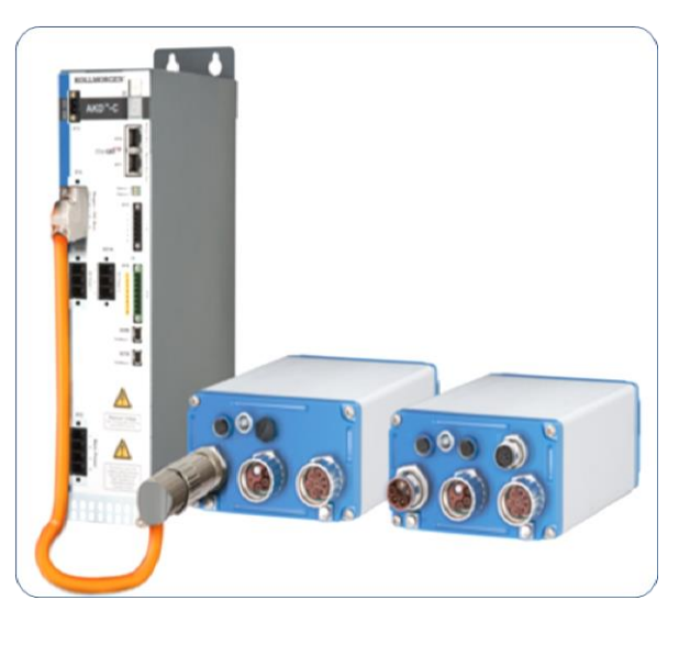
Structure of KOLLMORGEN's decentralized servo system with the AKD-C feed-in module and the decentralized AKD-N servo controller.

Another effect of moving the servo drive technology to the machine: the thermal losses are no longer concentrated at one spot in the control cabinet, which in turn saves money by eliminating air conditioning and thereby reducing operating costs over the long term. As a result of derating, KOLLMORGEN has made a conscious decision to develop the AKD-N decentralized servo controllers as an offset solution. This way the devices provide full power. With the hybrid "piggyback" solution the thermal discharge from the motors can result in more than 30 percent power loss. The "next door" approach also creates more freedom in selecting a motor compared with having everything in the center.