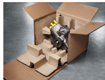
Molded Packaging Prototype