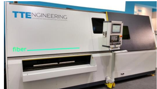
TOP600: overview, close-up of front and of rear

There are two versions available, the TOP600 Plasma and the TOP600 Laser , depending on the cutting technology used. The two machines are identical in terms of their configuration. The only changes are to the source used and, therefore, the type of cutting head used.