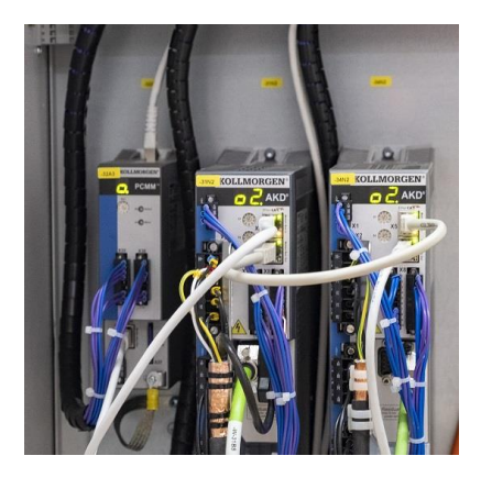
Left, KOLLMORGEN compact and highperformance PCMM controller and AKD servo amplifier. Right, the AKM servo motor capable of high acceleration.

The user-dependent access for this in the first step is carried out on the freely programmable controls in the IEC 61131-3 languages. It is part of the functional scope of the KOLLMORGEN Motion Controller PCMM. The compact device takes on the sequential control and the motion control of the connected AKD servo drives with the AKM synchronous servo motors. Motion Control has designed TBM in such a sophisticated way that the machine actually removes the bricks from the column with the beautifully soft motion task profiles. At the Landquart brickworks, the unit is placed directly between the formed part of the extruder and the discharge conveyor. The high overload capacity of the AKM motors up to five times the nominal current ensures that, during operation, the sudden occurrence of speed fluctuations does not lead to a fault in the cutting process. Changed requirements in power are not a rarity in the brick industry; they actually happen on a regular basis. After all, it's a natural product with a fluctuating consistency that is processed into bricks fully automatically.