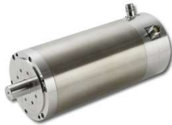
Kollmorgen's Stainless Steel W Series

Round, smooth surfaced stainless steel housed and sealed servomotors offer machine builders a machine-ready option to meet the most demanding processing and cleaning requirements. Sealed standard servomotors with special washdown ready coatings are also available for areas with less demanding