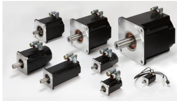
AKM™ servo drives by Kollmorgen: comes in 8 sizes, the motor for the perfect drive

In terms of motors, even the wide range of AKM™ Servo Motors contributed to C.M.C. choosing Kollmorgen as their partner in this project: AKM™ practically has an unlimited number of configurations and therefore allows for unprecedented choice and flexibility as well as top-level performance and an excellent power density. It is worth noting that the AKD™ servo drives are easy to set up and use thanks to their plug-and-play motor recognition and self-adjustment.