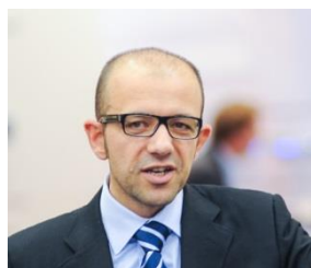
Author: Senior Sales & Key Account Manager, Kollmorgen Italy, KOLLMORGEN Italia

needs has allowed us to provide a solution, which in this specific case has brought about a reduction in the amount of cabling used; from the old system which required 1,500 meters down to 240 meters. We were able to save on more than one entire kilometer of cabling . I hope that we will be able to undertake new challenges ahead together, with the added value that has allowed us to stand out to date”.