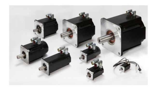
AKM™ servo drives by Kollmorgen: comes in 8 sizes, the motor for the perfect drive

In terms of motors, even the wide range of AKM™ Servo Motors contributed to C.M.C. choosing Kollmorgen as their partner in this project: AKM™ practically has an unlimited number of configurations and therefore allows for unprecedented choice and flexibility as well as top-level performance and an excellent power density. It is worth noting that the AKD™ servo drives are easy to set up and use thanks to their plug-and-play motor recognition and self-adjustment.